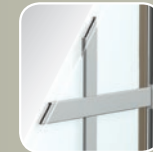
3/4" Flat, 5/8" or 1" Sculptured