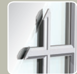
7/8" or 1-1/4" SDL with Shadow Bar